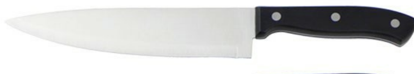
8" Chef knife