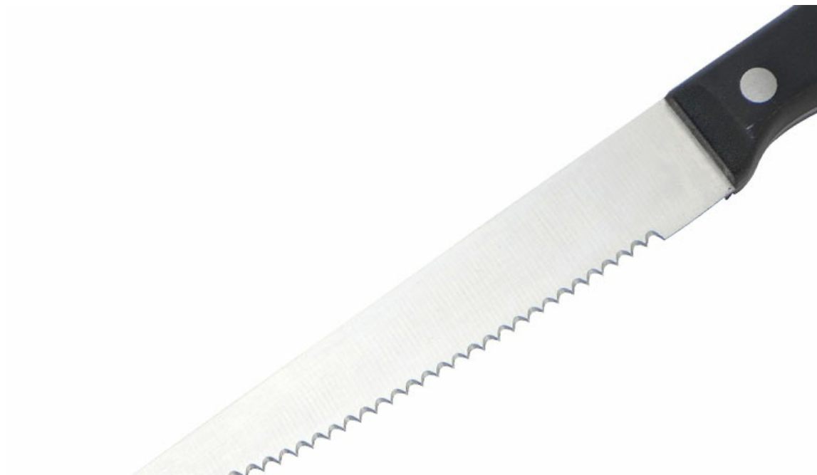
Close-up Photo of Blade

With beautiful designed handle and comfortable to hold