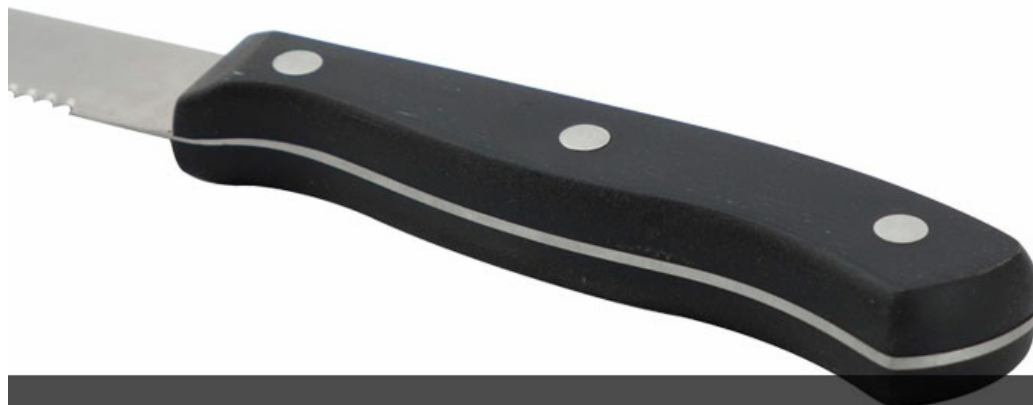
Close-up Photo of Handle

With beautiful designed handle and comfortable to hold