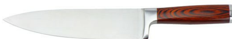
8" Chef knife