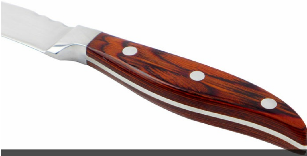
Close-up Photo of Handle

With beautiful designed handle and comfortable to hold