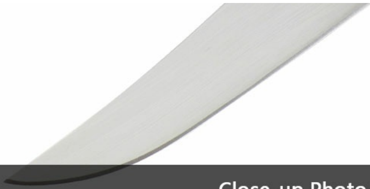
Close-up Photo of Blade

With beautiful designed handle and comfortable to hold