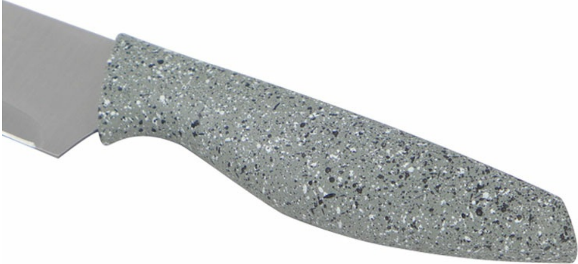
Close-up Photo of Handle

Soft-touch grip, more comfortable for holding.