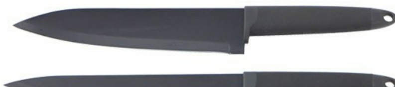
8" Chef knife