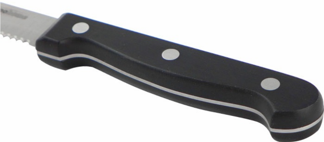
Close-up Photo of Handle

With beautiful designed handle and comfortable to hold