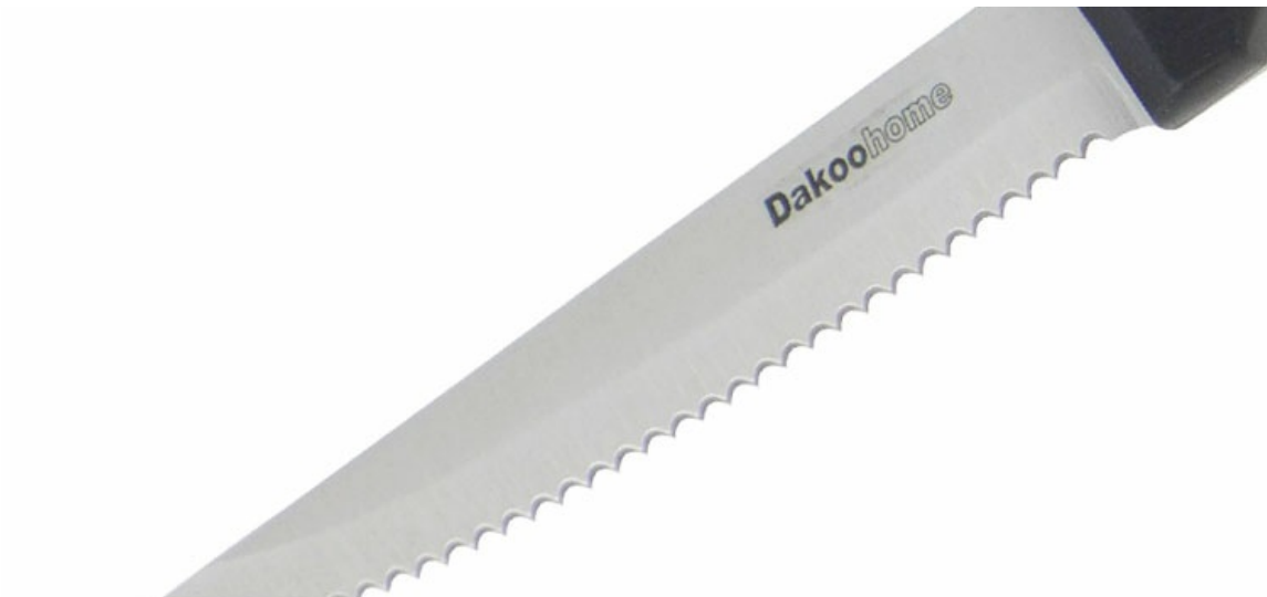
Close-up Photo of Blade

With beautiful designed handle and comfortable to hold