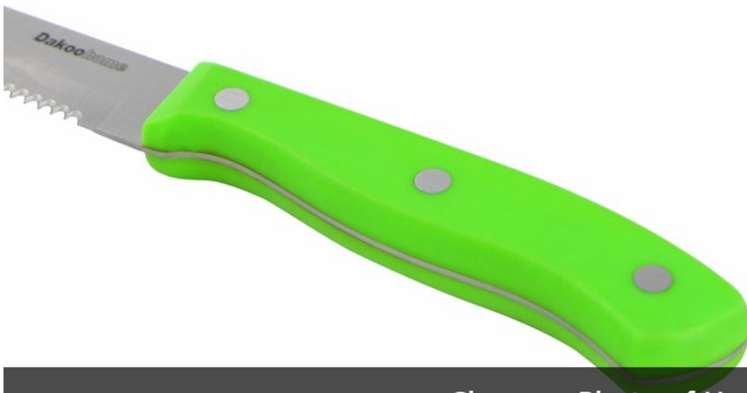
Close-up Photo of Handle

With beautiful designed handle and comfortable to hold