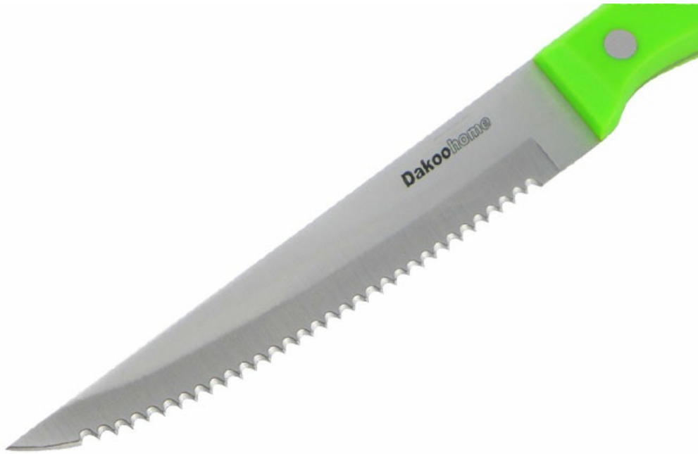
Close-up Photo of Blade

With beautiful designed handle and comfortable to hold