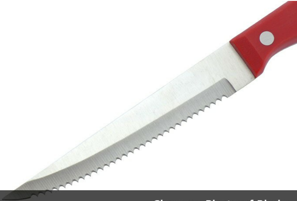
Close-up Photo of Blade

Made from 3Cr14, superior performance, sharp and durable