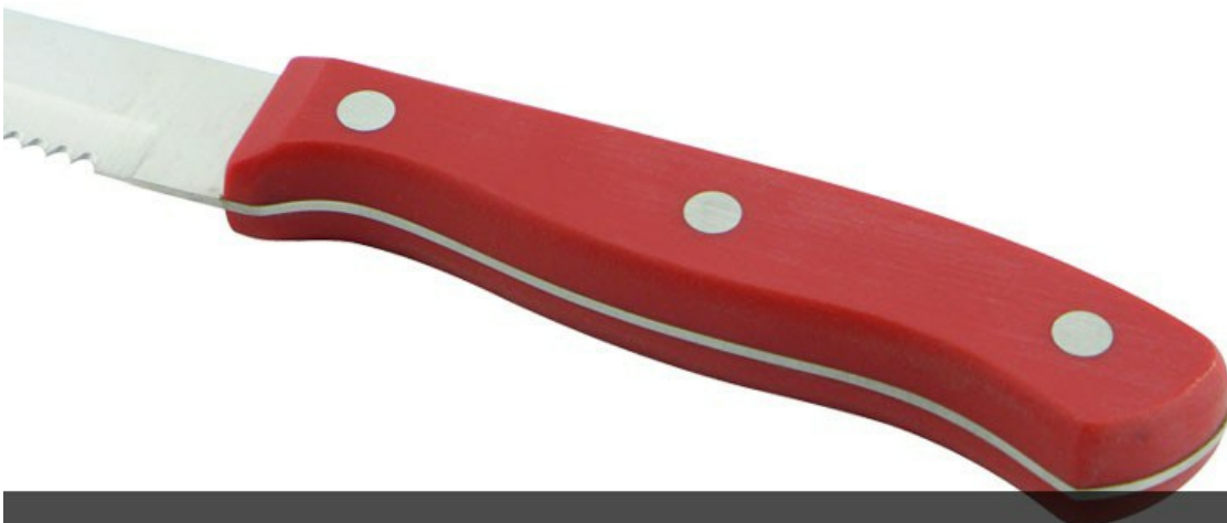
Close-up Photo of Handle

With beautiful designed handle and comfortable to hold