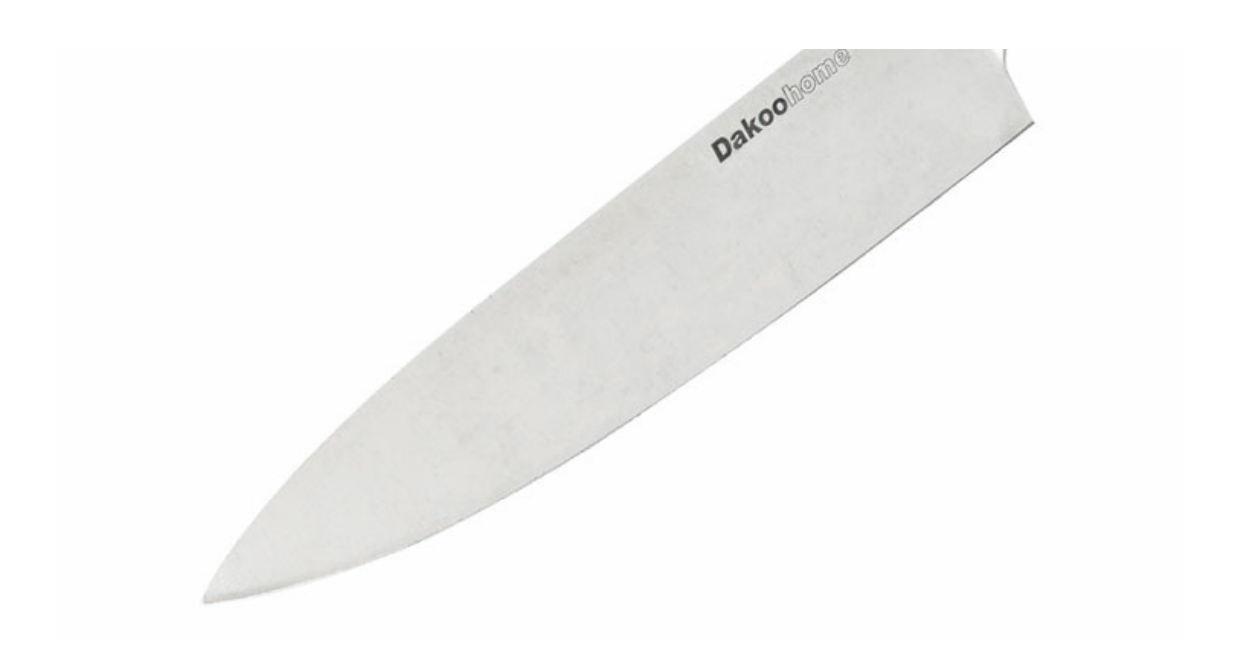
With #430 Coated handle and comfortable to hold