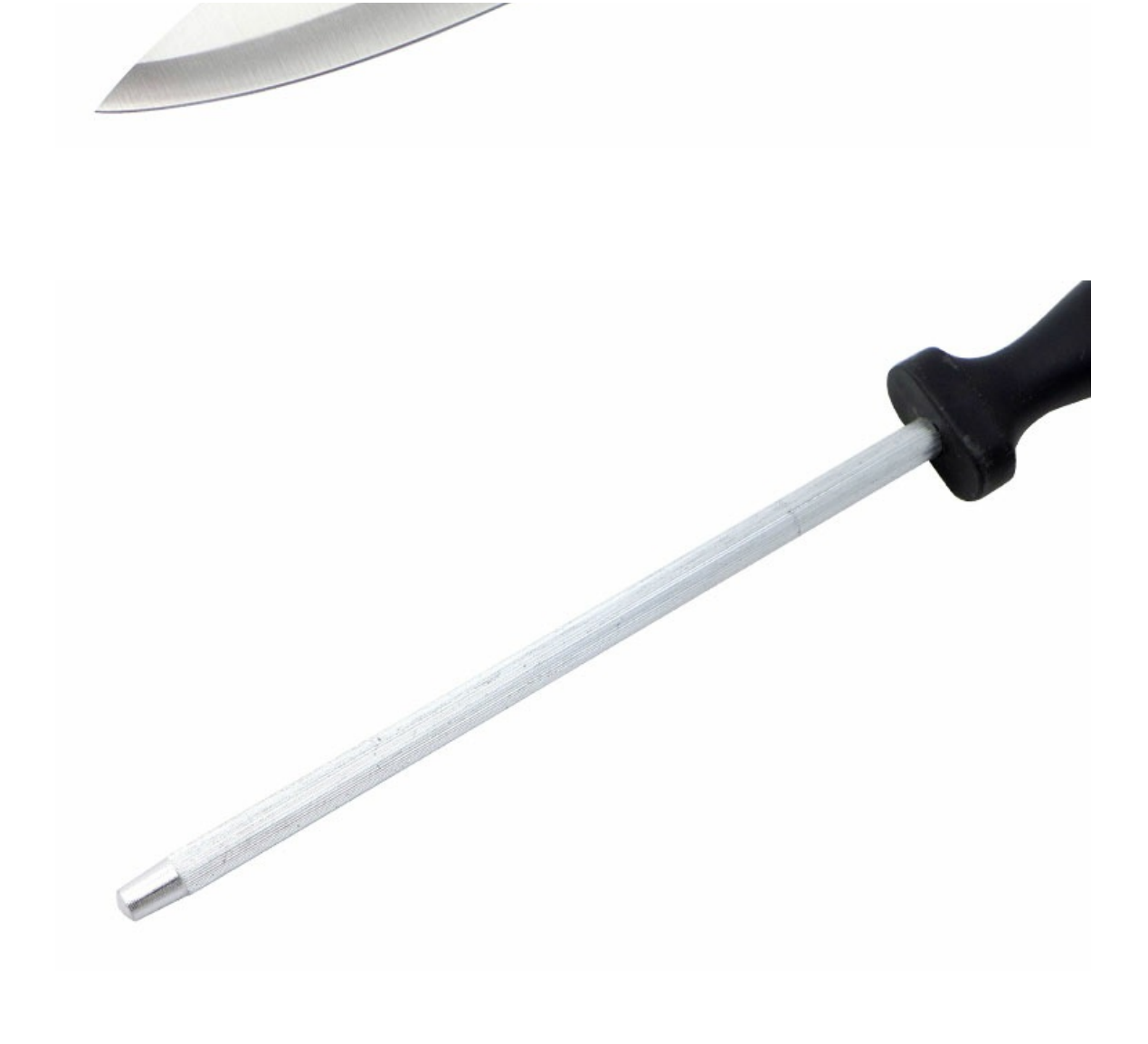
With beautiful designed handle and comfortable to hold