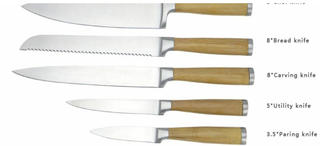
8" Bread knife