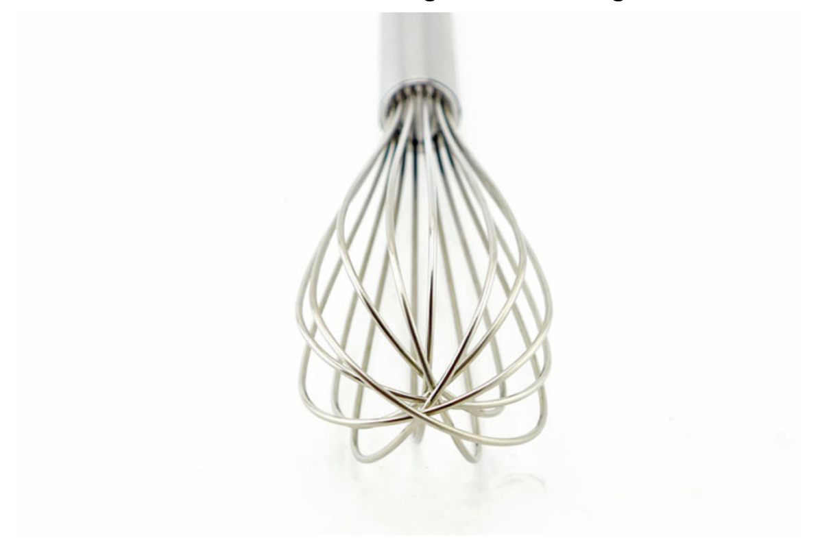
Fixed Overstriking Steel Wire Steel wire is in 2mm thickness, eight wires cross weaving, could not be easy to loose, the strength is stronger when stirring.