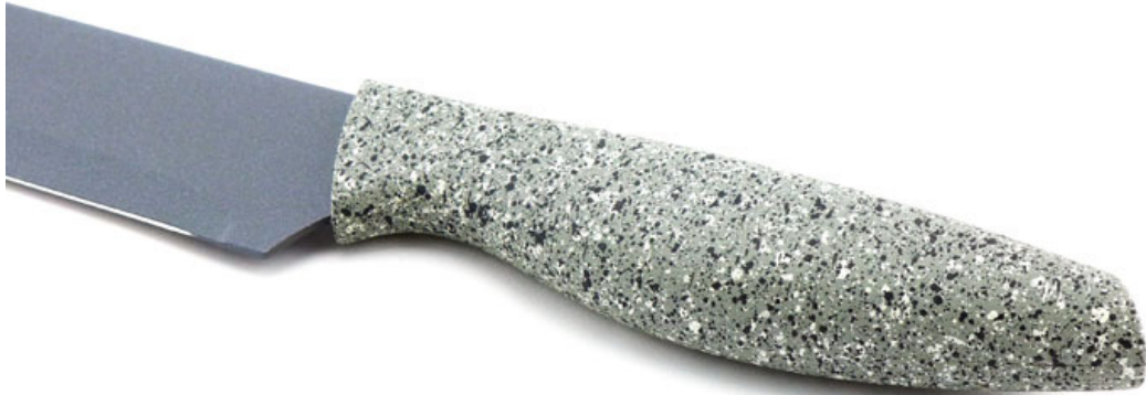
Close-up Photo of Handle