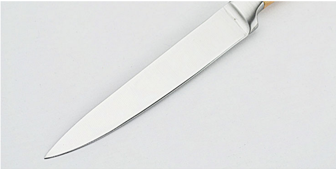
Close-up Photo of Blade