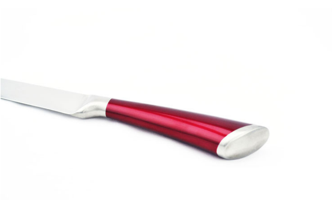
Close-up Photo of Handle