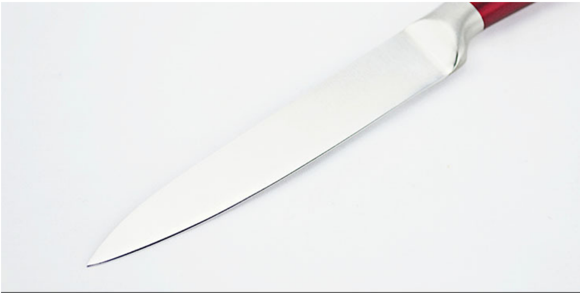
Close-up Photo of Blade