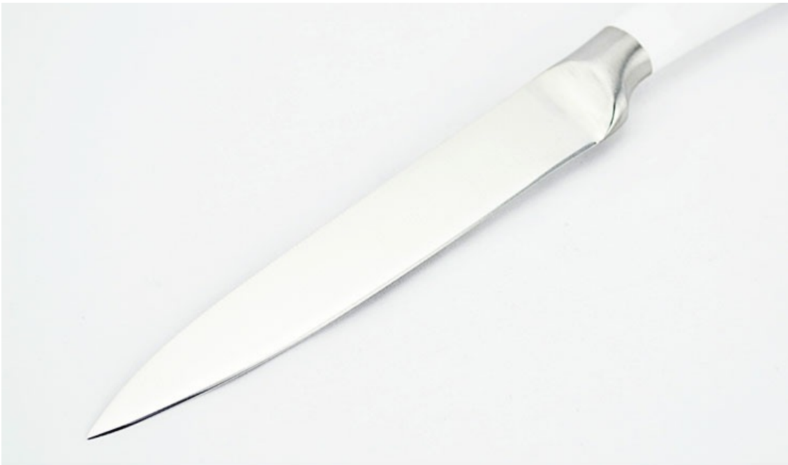
Close-up Photo of Blade