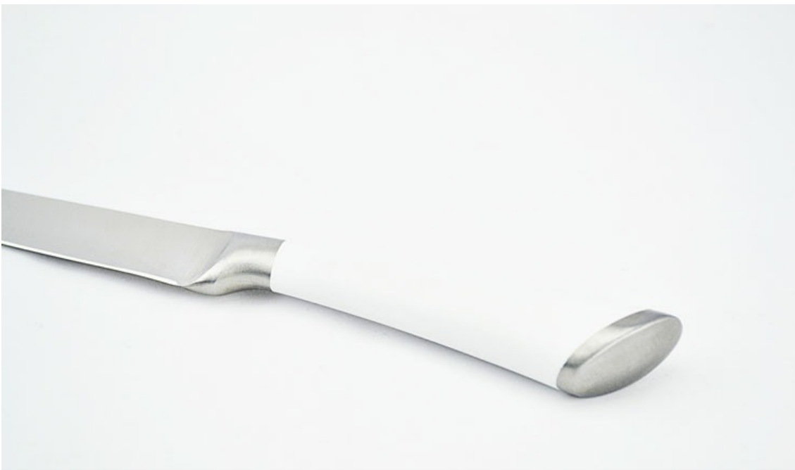
Close-up Photo of Handle