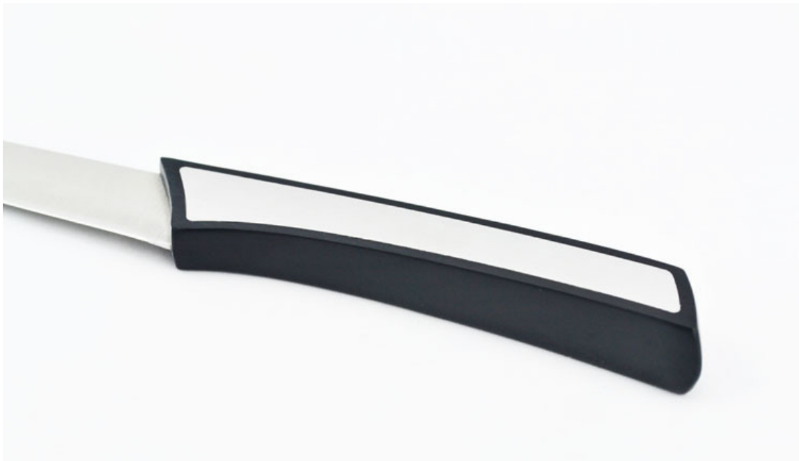
Close-up Photo of Handle