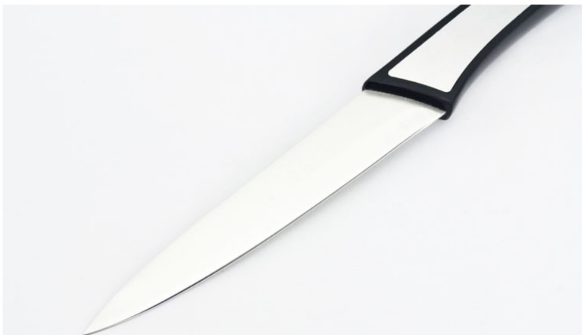
Close-up Photo of Blade