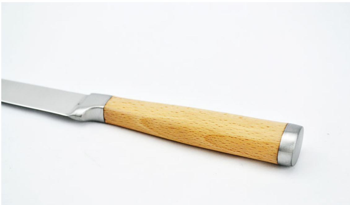
Close-up Photo of Handle