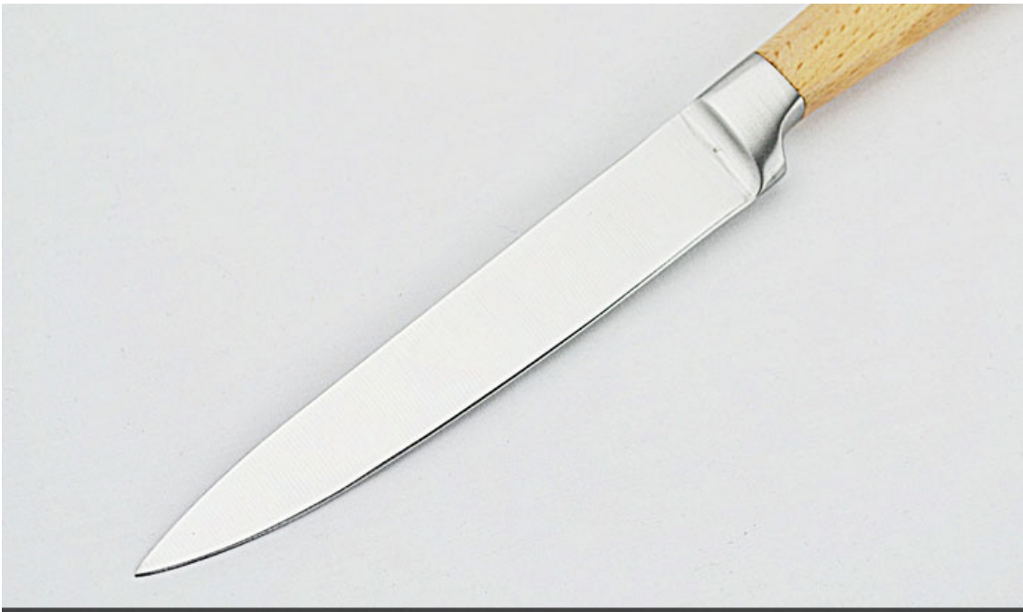
Close-up Photo of Blade