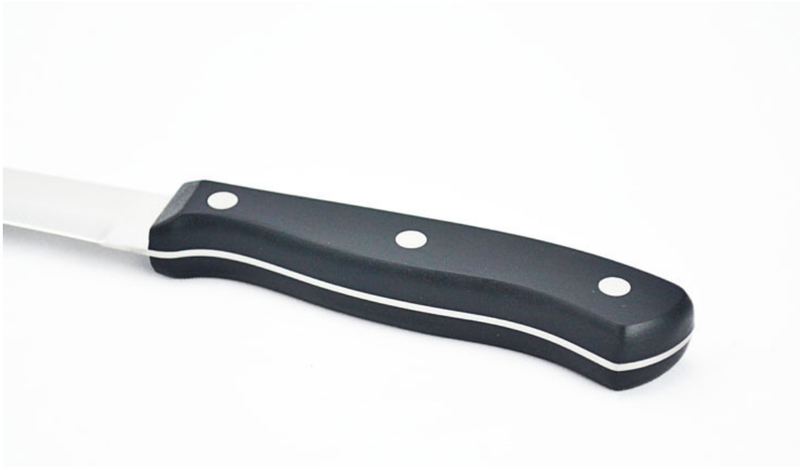
Close-up Photo of Handle