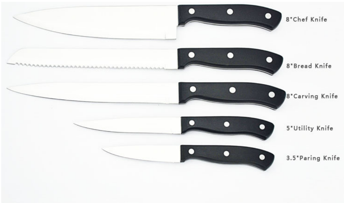
8" Chef Knife