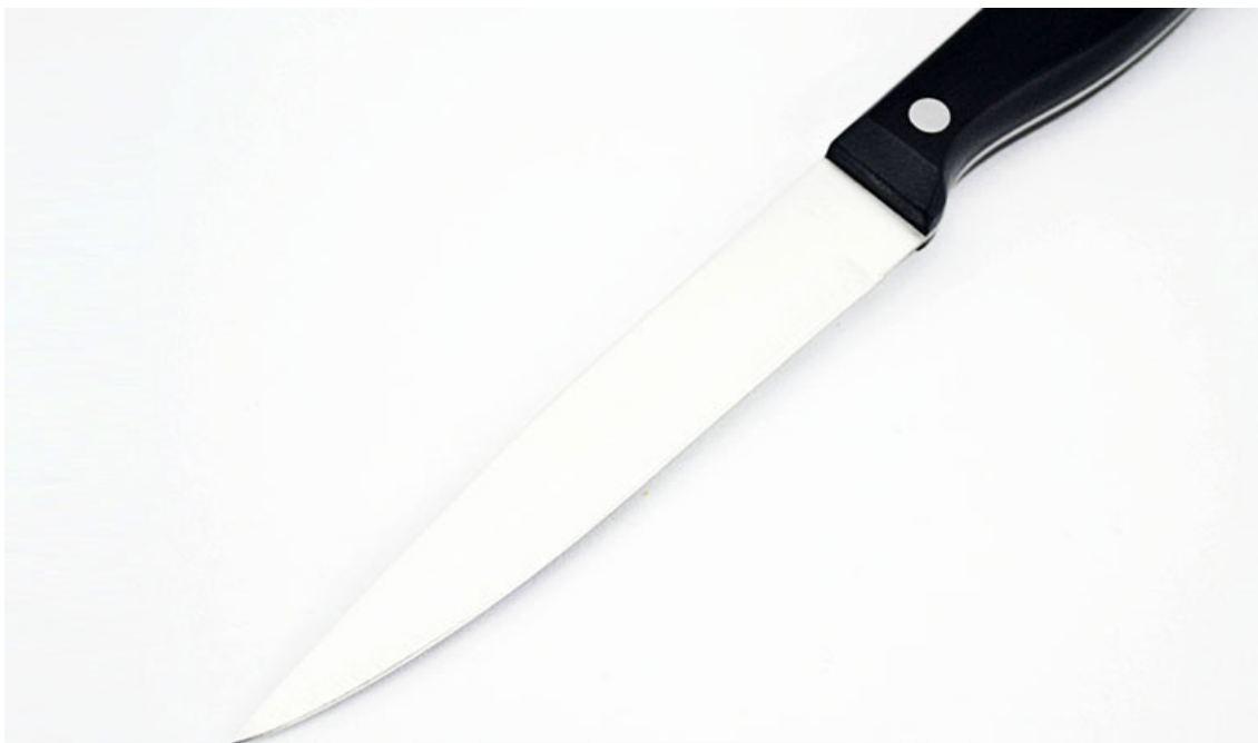
Close-up Photo of Blade