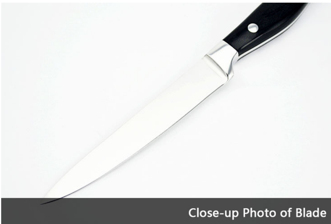
Close-up Photo of Blade