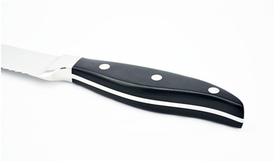
Close-up Photo of Handle