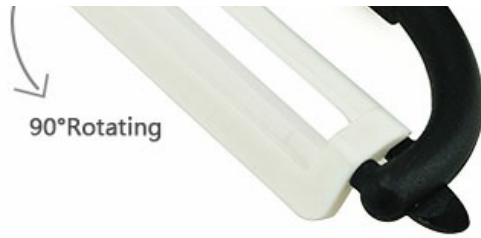
Close-up Photo of Peeler