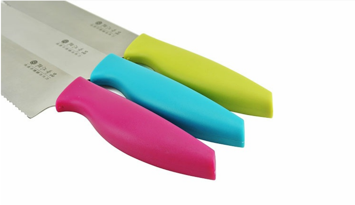
Close-up Photo of Handle