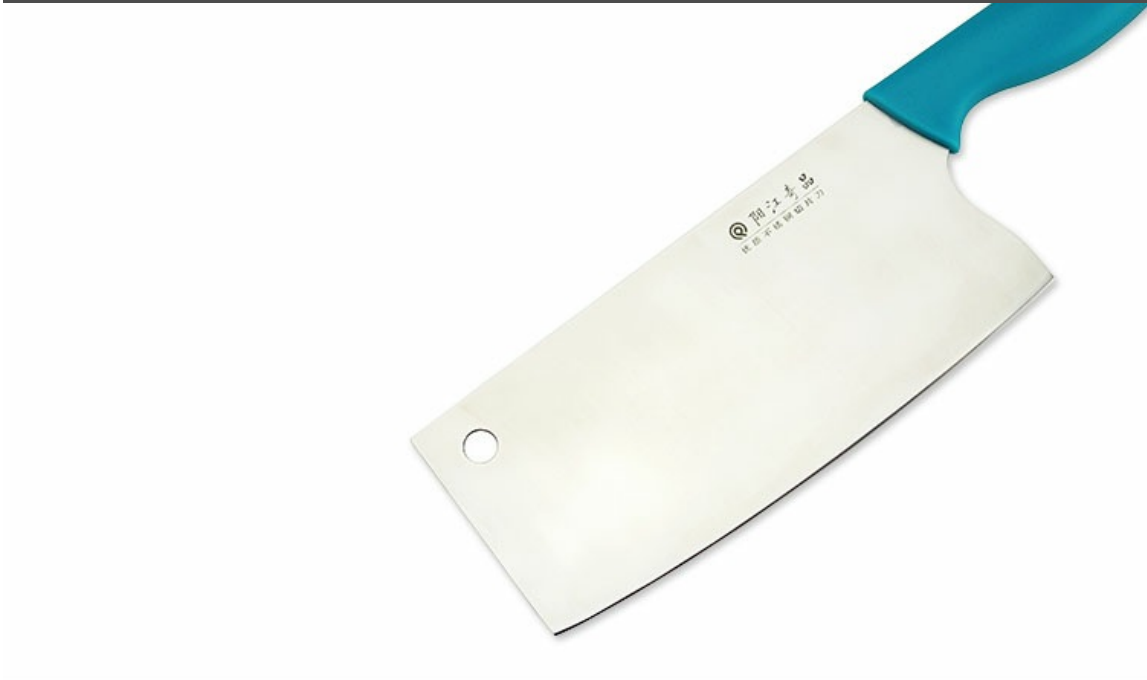
Close-up Photo of Blade