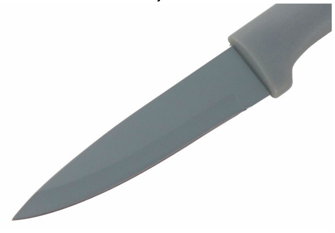
light and comfortable feel With beautiful designed handle and comfortable to hold